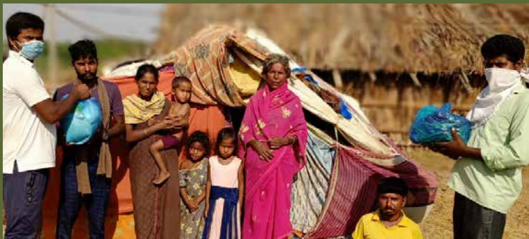
GT team bringing rations to a family in India

http://weblink.donorperfect.com/crisisrelief