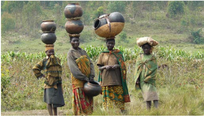
The Batwa of Burundi make unique pots, which these women carry.